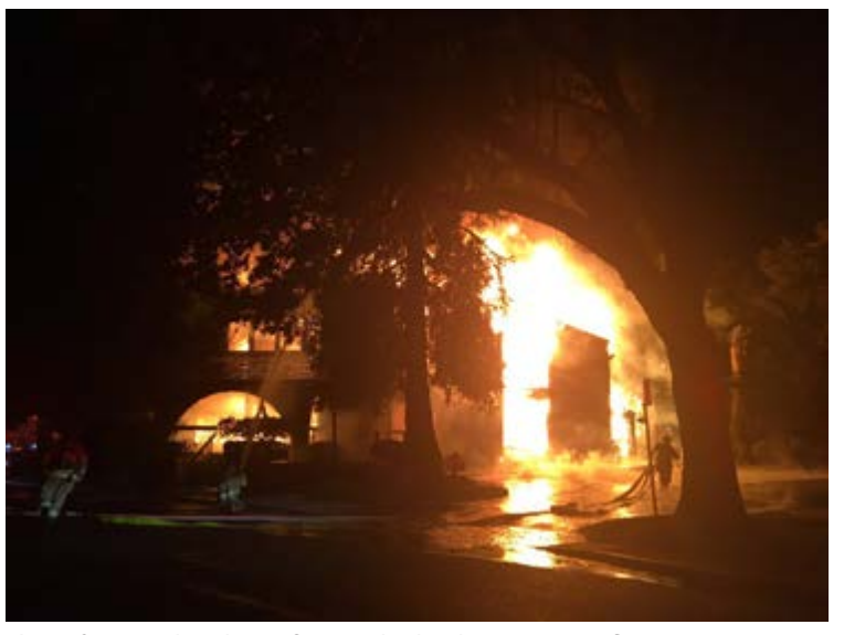
The Lafayette Chamber offices and other businesses in flames.